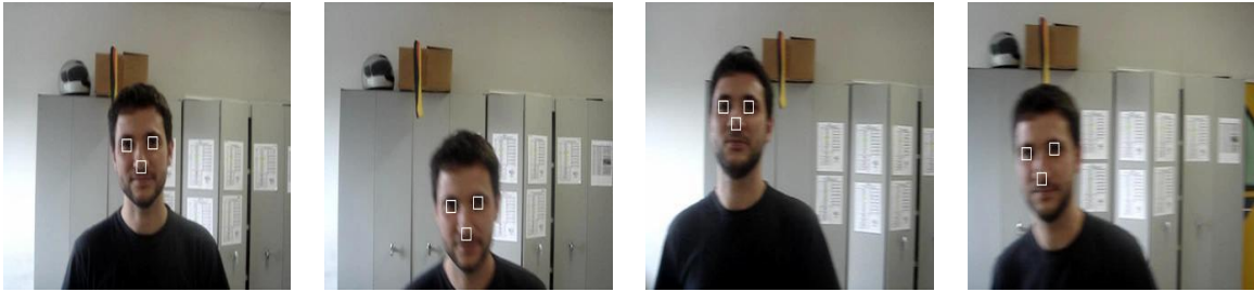
Fig. 3. A example of tracking result with our approach in the presence of large interframe displacement. Frames 1, 40, 60 and 110 of the sequence #5 are shown.