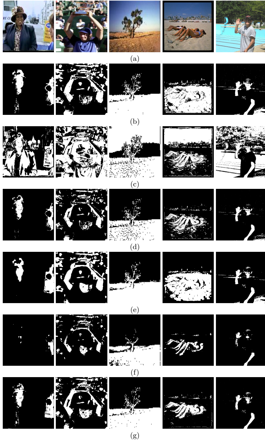
Fig. 1. Some example of skin detection results. (a) Original images. (b) Detection results with NRGB [18]. (c) Detection results with HS [8]. (d) Detection results with NRGB-HS [19]. (e) Detection results with CbCr [7]. (f) Detection results with the luminance method [4]. (g) Detection results with the proposed LCCS method.