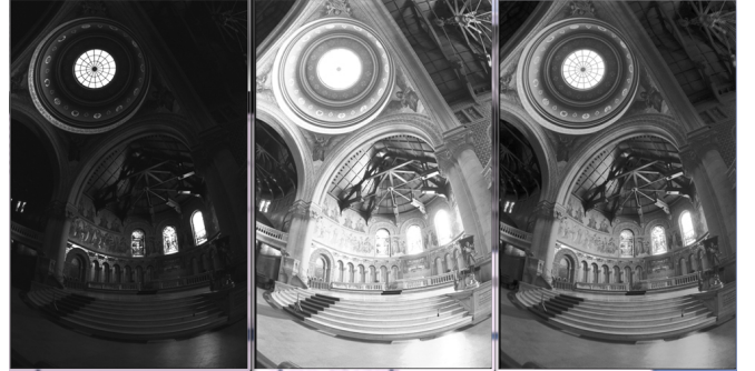
Fig. 2. Evaluation of the hardware architecture using image samples from the Debevec library.

We benchmarked our architecture using multiple image sources. First, we chose a database from the Debevec library [7], which includes images with variable exposure times. In our specific case, set of two images have been used to evaluate our architecture. An example of a resulting HDR image is shown on the right part of the Fig. 2 obtained from a LE frame (left part) and a HE frame (central part). Details in dark areas and bright are represented in the tone mapped image without artifacts. Secondly, we also evaluated our platform with realistic scenes acquired by our sensor board (see Figure 3). Results are similar to those obtained from Debevec library with a good reproduction of fine details in dark and bright areas. We can both distinguish the word "HDR" overexposed