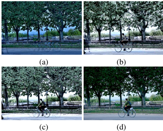
Figure 3. Ghost removal results. (a) HDR image showing ghost artefacts. (b),(c) and (d) Ghost removal results with the methods in [5], [7] and the proposed one, respectively.

best methods, in terms of sensitivity and specificity, for ghost detection are the graph-cuts based method [4], the prediction based method [3], the pixel order method [9] and the bitmap based method [7] respectively. We also compare our method against those approaches and the results are summarized in table 1. It is to be noted that the proposed method performs better than state of the art methods since it shows higher sensitivity and specificity values, i.e. it correctly detects almost all ghost pixels with very few false positives.