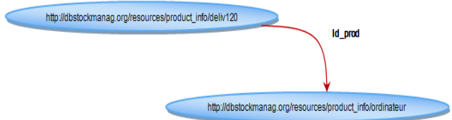
Fig. 9. Triplet RDF.

Remark: Each triplet is independent and the data structure is part of the data as we show in the next figure.