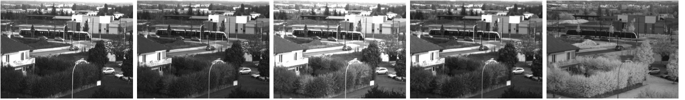
Fig. 2. Five spectral bands extracted from a multispectral image.

negatives, i.e. both a high precision and recall value. The F-measure combines precision and recall and make the analysis of results easier.