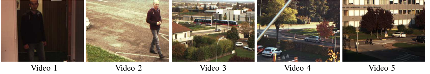
Fig. 1. Snapshots of each camera viewpoint of the video dataset.

For each scene, we have acquired a sequence of multispectral images whose framerate depends on the overall scene illumination, i.e. from 5 frames per second for dark scenes ( e.g. video 1) to 15 frames per second for bright ones ( e.g. video 3). The acquisitions are performed with a commercial camera from FluxData, Inc. (the FD-1665-MS). This camera is based on a 3-CCD system that provides simultaneous data for each spectral band. It can acquire 7 spectral narrow bands, six in the visible spectrum and one in the near infrared. An example of a multispectral image is presented in Fig. 2. This camera is light and compact and is adapted for videosurveillance applications.