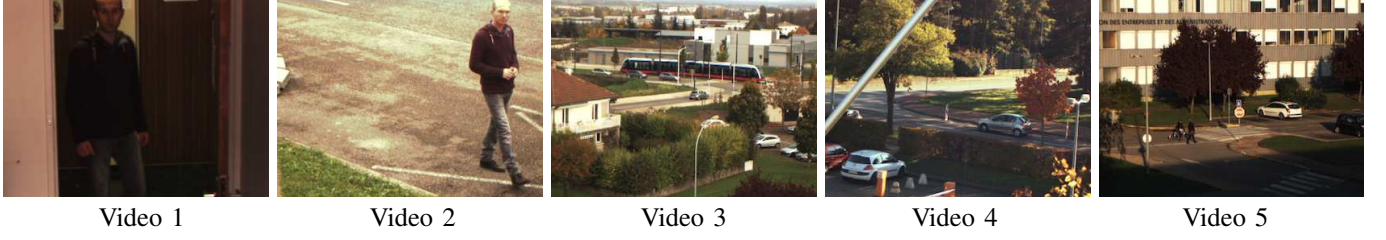
Fig. 1. Snapshots of each camera viewpoint of the video dataset.

For each scene, we have acquired a sequence of multispectral images whose framerate depends on the overall scene illumination, i.e. from 5 frames per second for dark scenes ( e.g. video 1) to 15 frames per second for bright ones ( e.g. video 3). The acquisitions are performed with a commercial camera from FluxData, Inc. (the FD-1665-MS). This camera is based on a 3-CCD system that provides simultaneous data for each spectral band. It can acquire 7 spectral narrow bands, six in the visible spectrum and one in the near infrared. An example of a multispectral image is presented in Fig. 2. This camera is light and compact and is adapted for videosurveillance applications.