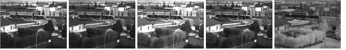
Fig. 2. Five spectral bands extracted from a multispectral image.

negatives, i.e. both a high precision and recall value. The F-measure combines precision and recall and make the analysis of results easier.