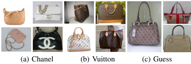
Fig. 4. Sample images from the dataset of exp2 : brand recognition.

brands, i.e. Vuitton, Guess and Chanel. An illustration of this dataset is presented in Fig. 4. We collected about 160 images per class for this second experiment. Each set has been divided into training/test subsets. We used 100 images in the training subset and the rest is used for the tests. The objective of this experiment is to identify the brand of a bag given an image. Results are presented using the Average Precision (AP). The visual codebook has been generated using k-means and MCL for the clustering step.