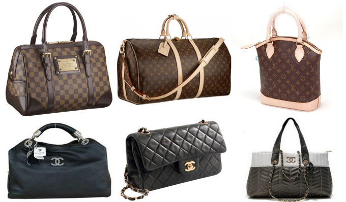
Fig. 1. Illustration of the strong visual identity of two well-known brands. In the first line, Vuitton's bags are presented and Chanel's ones in the second line.

Large amount of researches on content-based image retrieval and object recognition have been carried out in the