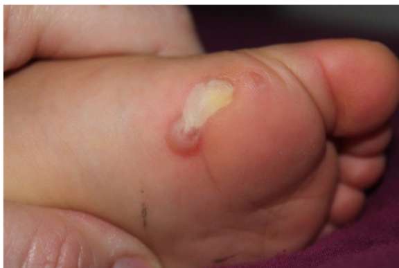
Fig. 1 Blisters on the sole in a child

constant or frequent pain and 56% unable to walk more than 1 km because of pain, as compared with 40% and 21%, respectively, during the winter.