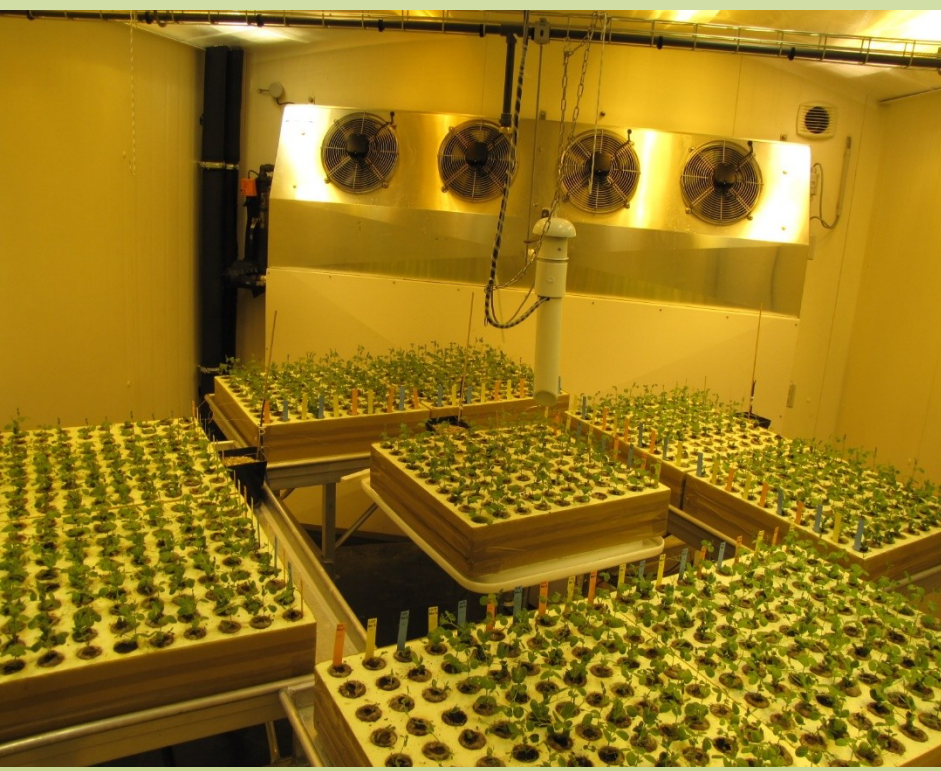
Figure 1. climatic chamber