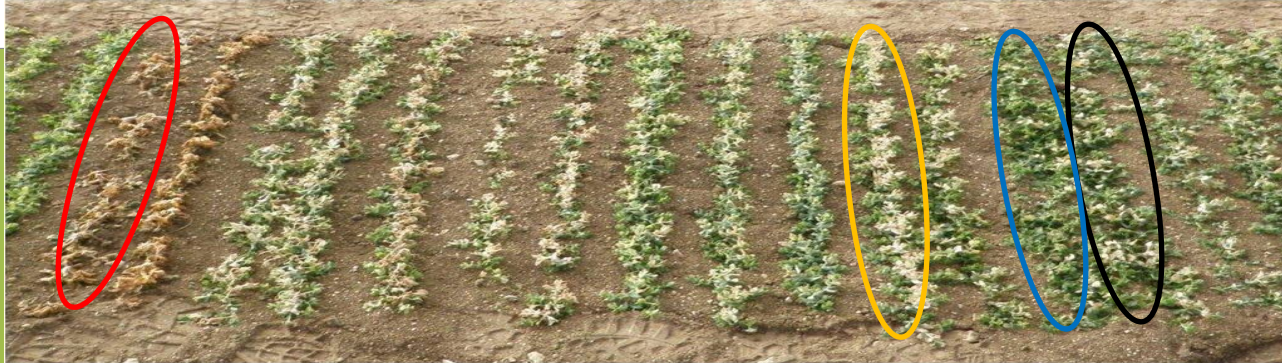
Figure 5. TEL50 and 95% confidence intervals, compared to visual frost damages observed in 2012 at the Chaux-des-Prés field platform. a, b, c : SNK grouping of the TEL50 values