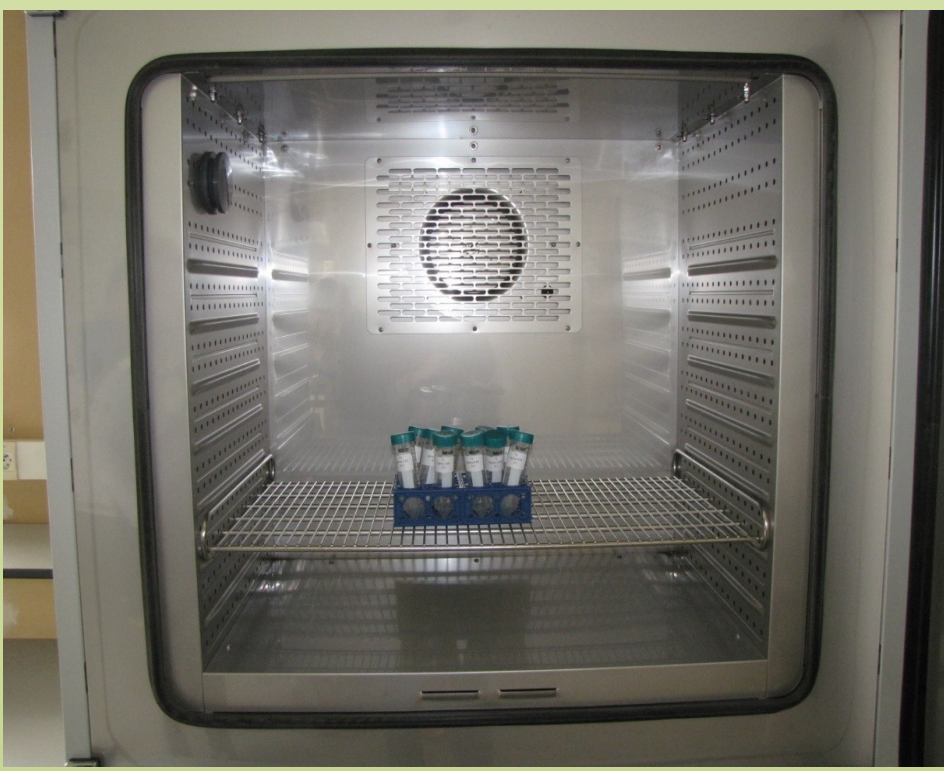
Figure 2. programmable freezer