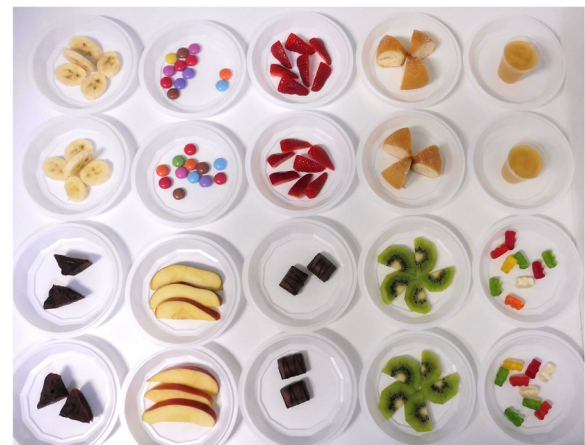
Fig. 1 Picture of an individual buffet

Values are shown as the means \pm SD. Energy density was obtained from the French food composition database [42] or from the food packaging when available