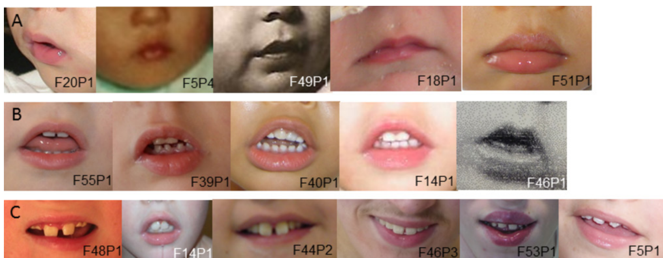
Figure 3 Focus on the lower part of the face in patients with an interstitial Xq28 duplication involving MECP2 . Note the small mouth and the open mouth appearance with a convex upper lip during early infancy (A, B), and the prominent central incisors after childhood (C).

drug-resistant. Among 31 patients for whom data were available, a neurological regression was observed after seizure onset in 12 patients (39%), including 11 patients with drug-resistant