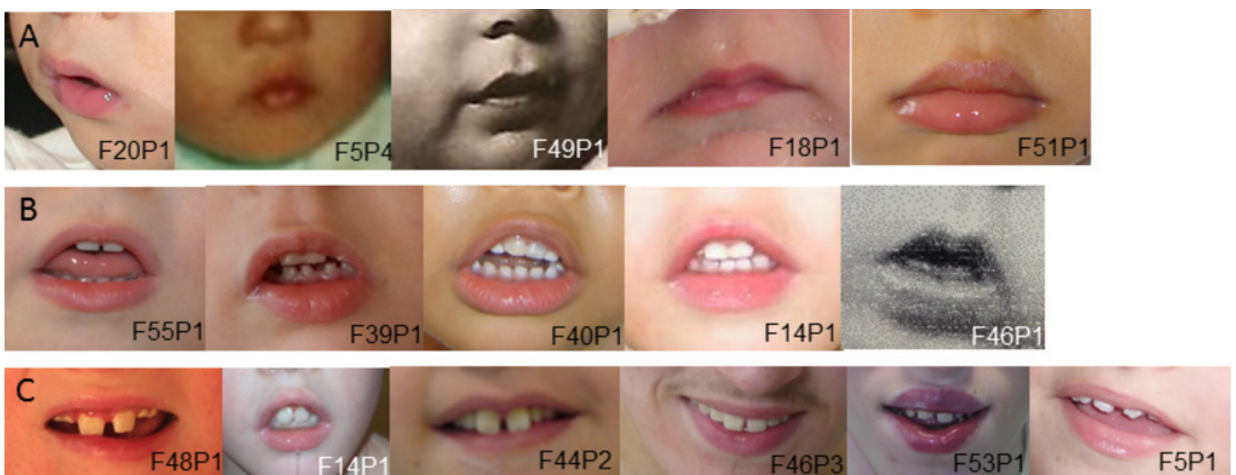
Figure 3 Focus on the lower part of the face in patients with an interstitial Xq28 duplication involving MECP2 . Note the small mouth and the open mouth appearance with a convex upper lip during early infancy (A, B), and the prominent central incisors after childhood (C).

drug-resistant. Among 31 patients for whom data were available, a neurological regression was observed after seizure onset in 12 patients (39%), including 11 patients with drug-resistant