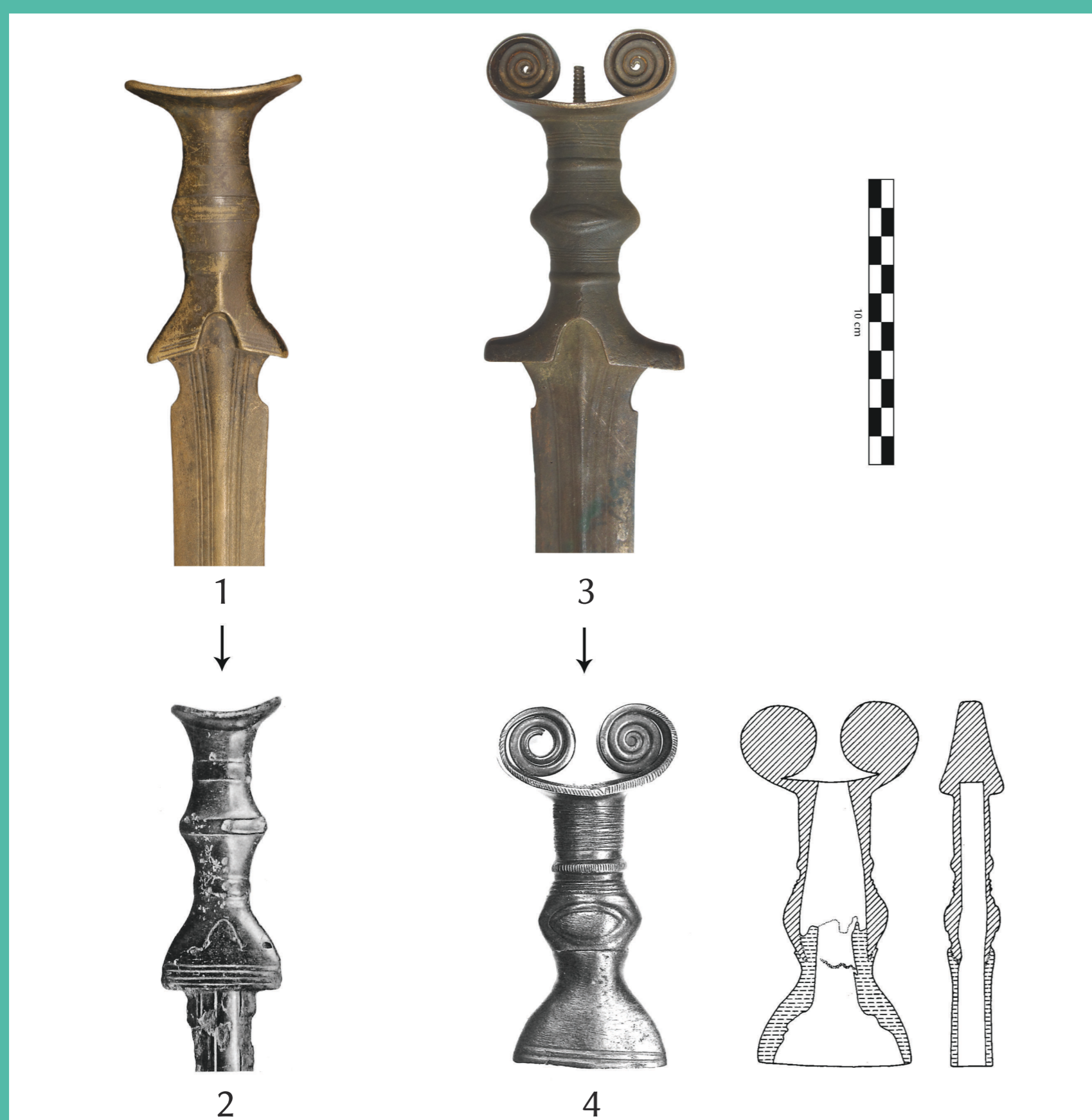
Fig. 3 — Comparison between typical wing-shaped guard swords and customized bell-shaped guard swords from north-eastern Europe. 1. Blerik-Tegelen (The Netherlands, © L. Dumont). 2. Ostrowiec Slawienski (Poland, Sprockhoff 1934). 3. Mâcon (France, © L. Dumont). 4. Berlin-Buch (Germany, Seyer and Michas 1994-95 and Wüstemann 1994-95).