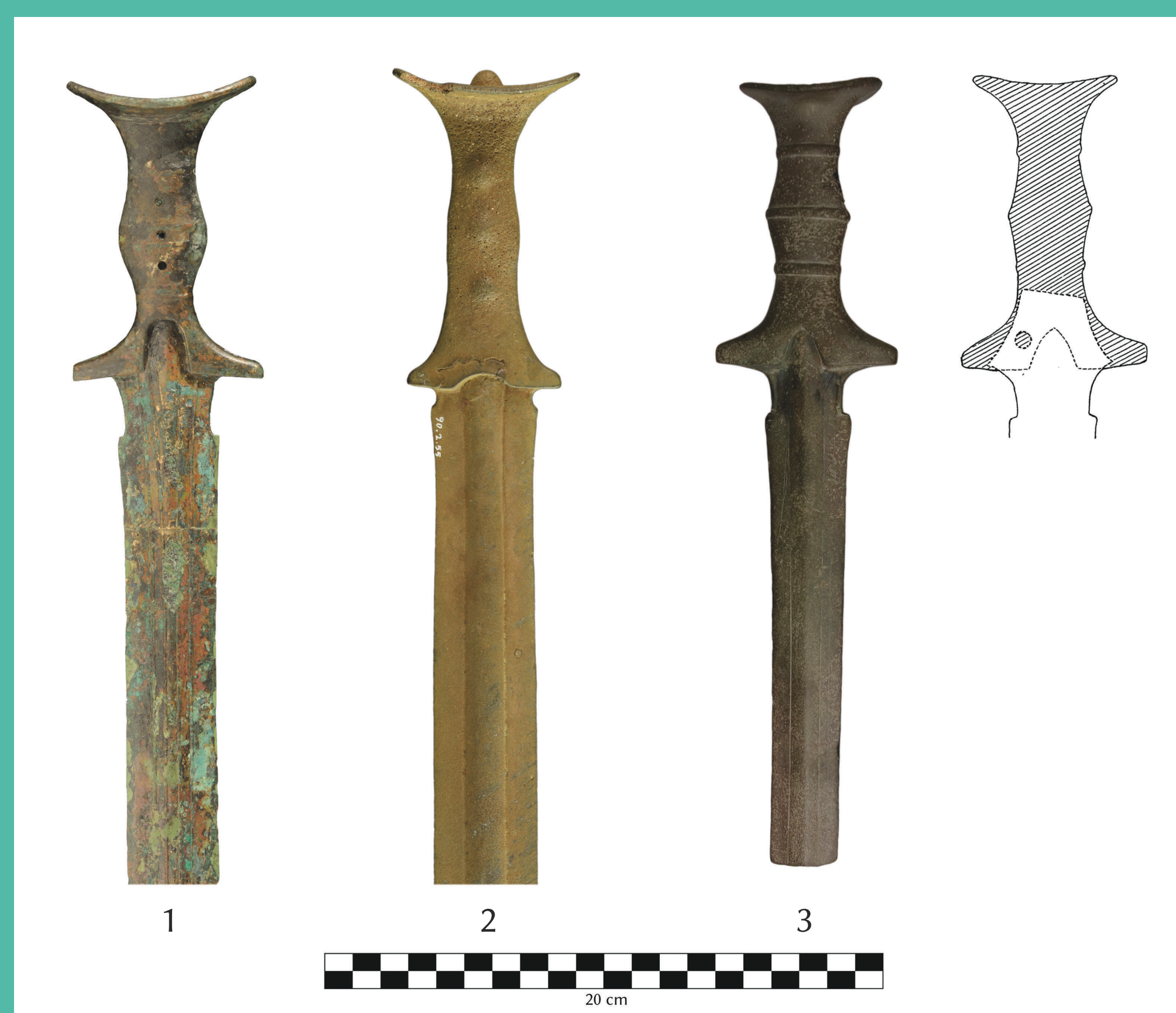
Fig. 2 — Möriegen and Atlantic carp's tongue swords with customized hilt found in eastern France. 1. Saint-Romain-de-Jalionas (Isère). 2. Ouroux (Saône-et-Loire). 3. Toul (Meurthe-et-Moselle). Interpretation of the radiograph after Liéger and Marguet 1974.

The 9 th century BC is characterized by a very large variety of sword types in Europe. There is a clear opposition between Atlantic Europe with typical tripartite-tanged swords and the central part of the Continent where there is a majority of bronze-hilted sword, whose shapes vary according to the considered area (fig. 1). There are of course no clear borders and some swords were scattered outside their main distribution area. Some of these “foreign” swords were customized to fit the visual identity they were supposed to have in the region they were found in, witnessing the reappropriation of these objects by local users. We will here focus on two cases: the customization of Atlantic swords in eastern France and the guard modifications in north-eastern Europe.